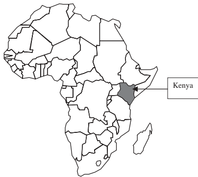
Brief Country Profile: Kenya

north of Lake Naivasha (Ewbank Preece Limited, 1989). Further work that produced positive results was carried out on the two exploratory wells drilled at Olkaria in the 1950s.