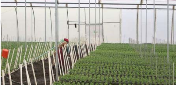
Greenhouse Flower Production

The provision of medical care for workers and their families was somewhat better on code adopting farms than on non-adopting farms. However, medical check-ups for workers were not included.