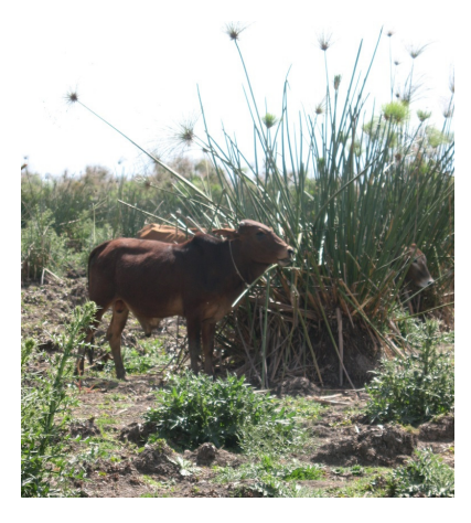
A source of nutrients during the drought