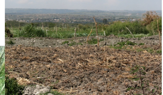
Recently cleared papyrus patch to be converted to small-scale agriculture