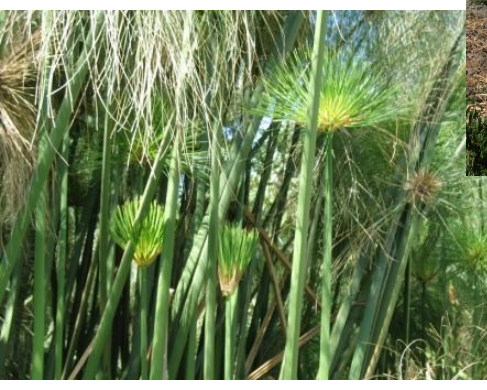
A healthy clump of Cyperus papyrus

The first step will be to determine the optimal design criteria for restored plots, by experimenting with variations in: (a) source material (e.g. seeds, saplings, rhizome pieces, transplanted mature clumps); (b) starting population size; (c) slope gradient and water depth; (d) connectedness of patches; (e) protected (e.g. within rockfilled gabions to prevent hippo damage) or unprotected plots,