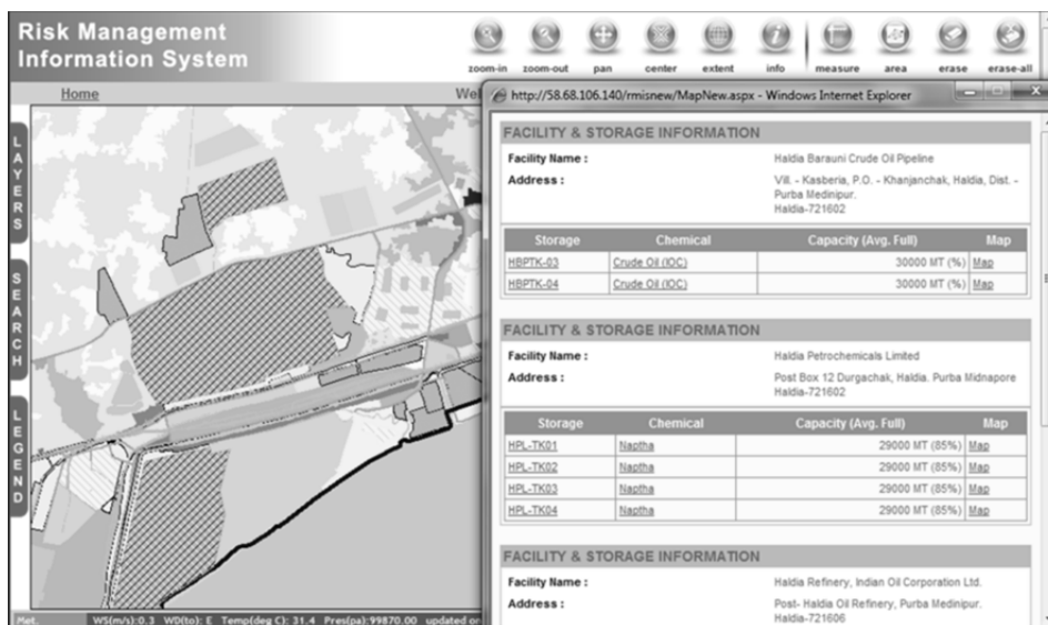
Figure 9.2: Querying RMIS for regulatory planning

database can aid in regulatory planning activities - like understanding overall hazard potential in an area. This is illustrated through a search in the RMIS to identify MAH industries which store flammable hazardous chemical of quantity more than 10,000 metric tons, as in Figure 9.2 below.