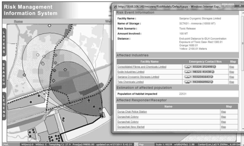
Figure 9.4: RMIS functional view in emergency response mode

are often handicapped by the lack of sharing of information or its availability in the right form, and the coordination between different agencies and emergency responders is often weak. Discussions with administration and response personnel reveal that one of the key aspects that prevent efficient emergency management is the lack of updated and valid information available in the paper based on-site emergency management plans. Also, no computerized tool presently exists which can provide assistance to emergency responders to help tackle an emergency situation within short time, rather than reviewing a report to extract information which is often too time consuming.